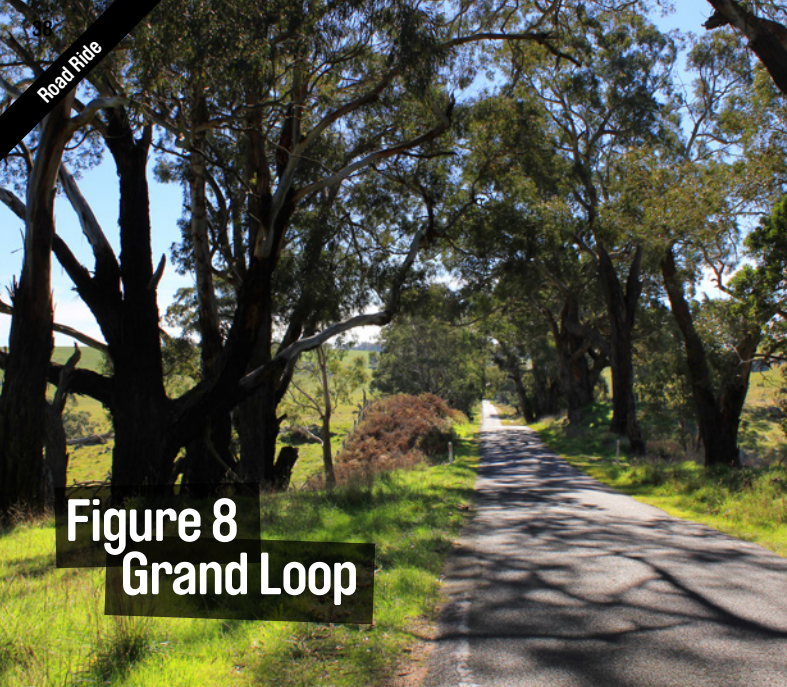
Figure 8 Grand Loop